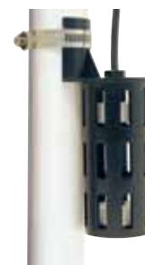
Dual Float Switch