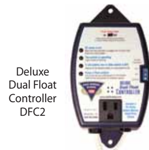
Deluxe Dual Float Controller DFC2